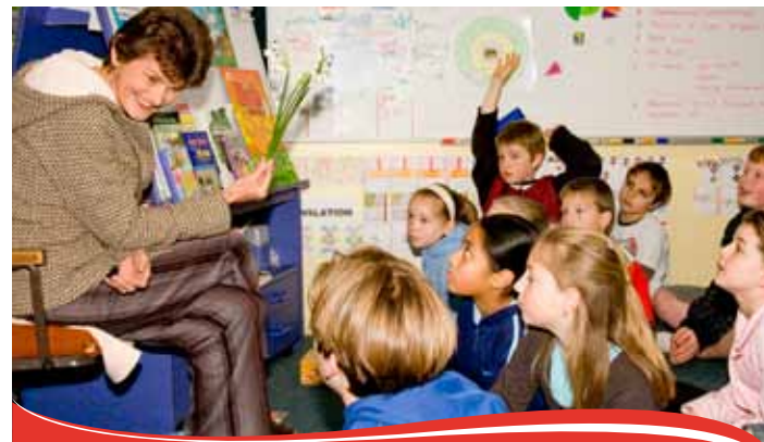
Children listen attentively during a CRE (Bible in Schools) class.

For the first time, as many as 140,000 New Zealand school children are to receive their own copy of the Tarore story. Through this project, it is hoped that the