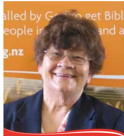
Award winning author Joy Cowley.

"My Bible is a well-worn map for my life journey and I do not read it alone. The Holy Spirit is always there to guide me to the teachings I need, whether they be of challenge or celebration, acceptance or affirmation, and every time I open my Bible, I come to a larger place."