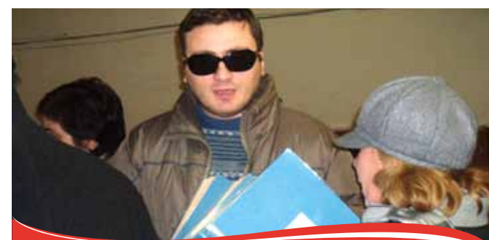
A Bible Society worker distributes Braille Gospels.

* Bible Society New Zealand supporters contributed earlier this year to help provide Braille Bibles to Georgia and other countries.