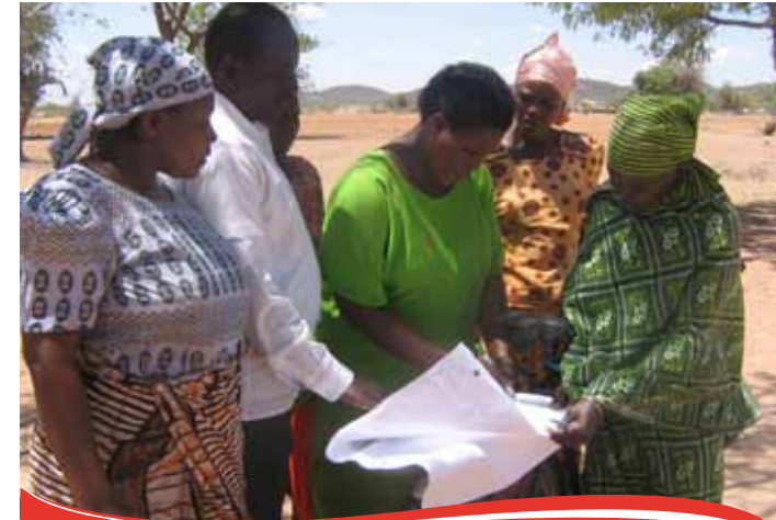
Participants in a 'Good Samaritan' programme workshop in Mkwana, Tanzania. This was one of the programmes supported by Bible Society New Zealand.

It is thought that around 8.8 percent of Tanzania's population of 40 million have the disease.