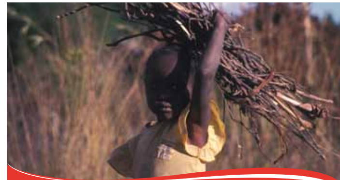
A young Zimbabwean girl gathers twigs for fuel.