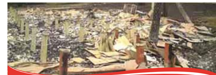
A property razed to the ground by the bushfires.

In the coming months and years as communities are re-established, Bible Society will provide churches, schools and Christian organisations with new Bibles. Please pray for the survivors, support workers and churches in the area.