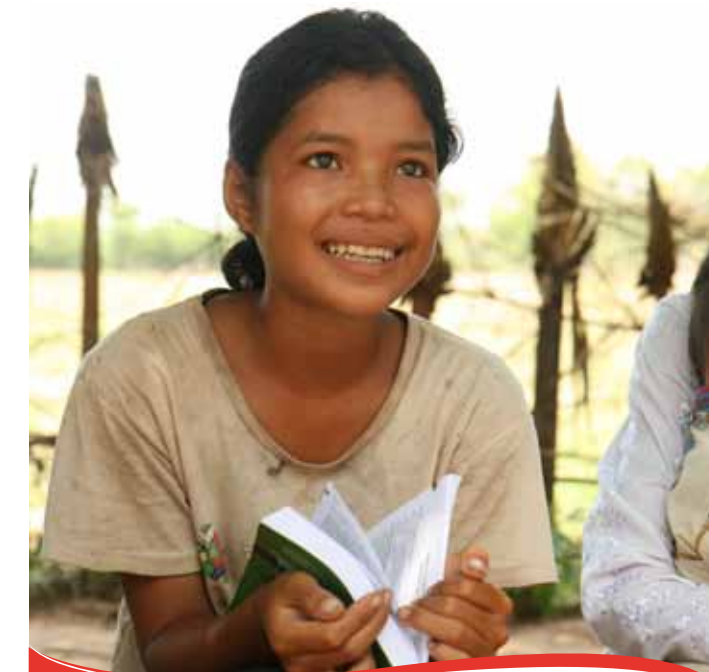
A young Cambodian woman is happy to receive her first Bible.

Let's move forward together, secure in the knowledge that we are His people and that our calling to be a light to the world is now more important than ever.