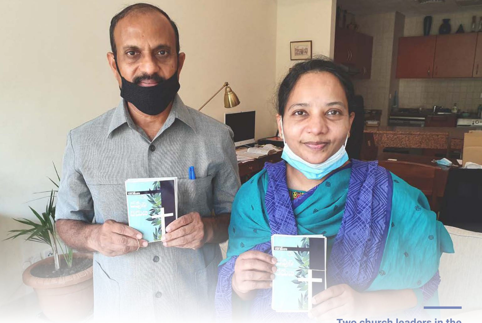
Two church leaders in the UAE with Scripture booklets for migrant workers.