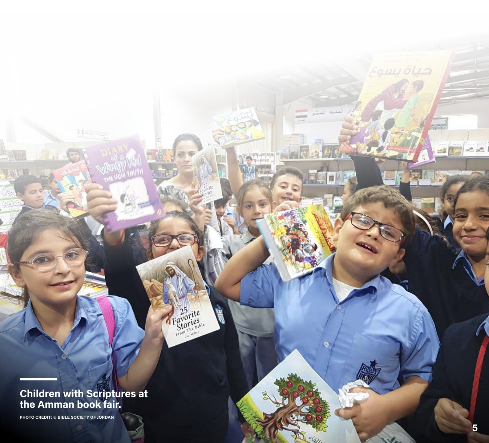
Children with Scriptures at the Amman book fair.

PRAY THAT CHRISTIANS IN JORDAN WILL HAVE THE COURAGE TO BE OPEN ABOUT THEIR FAITH DESPITE OPPOSITION. PRAY THAT THEY MAY BE FED BY THE SCRIPTURES AND RAISE A GENERATION THAT SEEKS GOD ABOVE ALL ELSE.