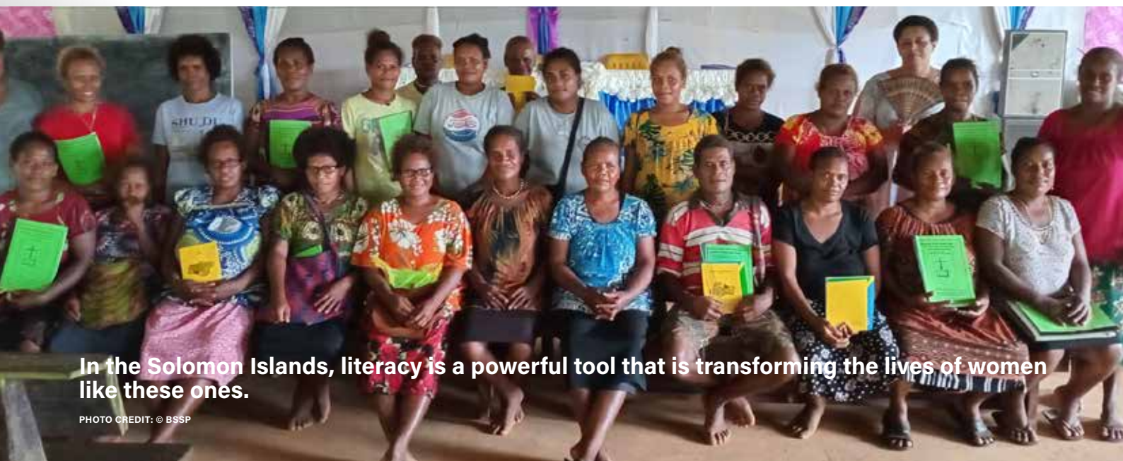
In the Solomon Islands, literacy is a powerful tool that is transforming the lives of women like these ones.

Through this literacy project, women are gaining confidence and actively participating in church and community activities. Their new