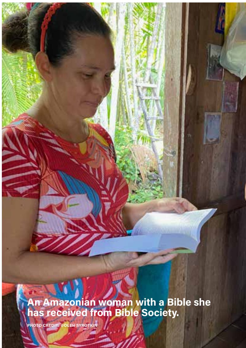
An Amazonian woman with a Bible she has received from Bible Society.